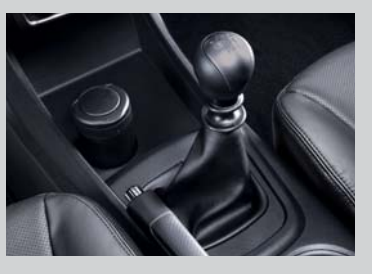
Gear shift indicator with 6-speed manual