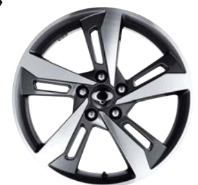
18" alloy wheels (diamond cutting)