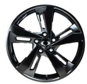
18" alloy wheels (black diamond cutting)